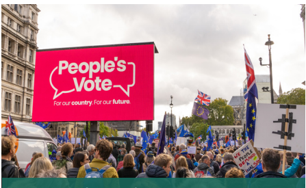
"Together for the final say" march in London on 19 October 2019

I am not a lone voice. I was proud to wear the beret with EU stars on a march in London, with about a million others, campaigning for a People's Vote. I will go on campaigning to minimise the degree of separation and hope that it will not be many years before the UK will be back in the EU. In the meantime, fortunately, UK former MEPs can remain involved as members of the FMA.