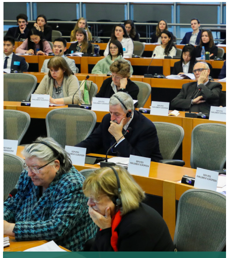
Annual Seminar 2019, (European Parliament, Brussels)